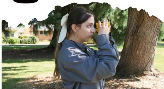
Oregon UCF member uses hypsometer instrument to measure tree height during tree survey.