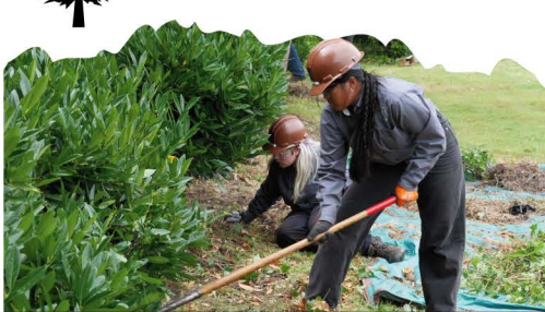
Washington UCF crew removes invasive weeds from native plantings at Fife City Hall.