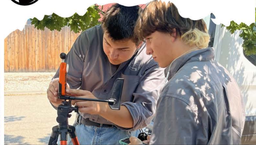
Idaho UCF crew records data from weather monitoring stations in Boise to measure how trees affect heat.